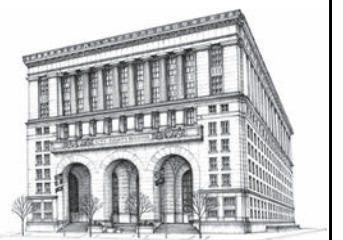
Allegheny County City-County Building 18 x 24 inch print