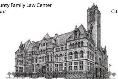
Allegheny County Courthouse 18 x 24 inch print