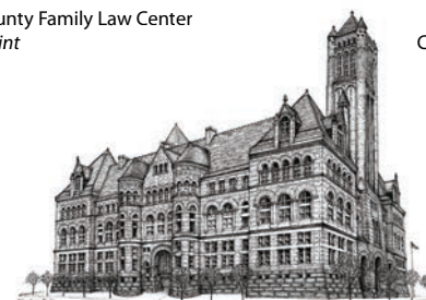
Allegheny County Courthouse 18 x 24 inch print