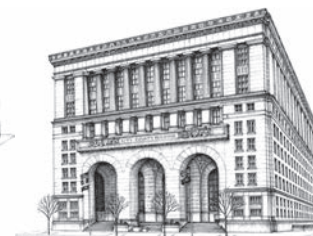
Allegheny County City-County Building 18 x 24 inch print